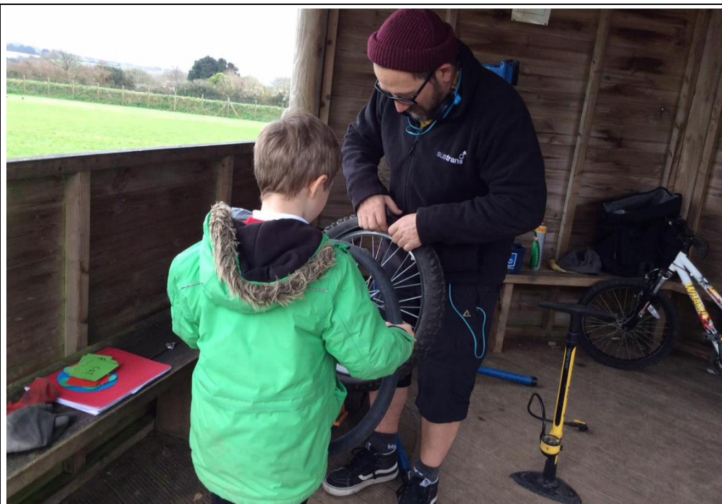
Thursday 21 st March – Down's Syndrome Day – Everyone enjoyed wearing odd socks to celebrate our differences and raise awareness.