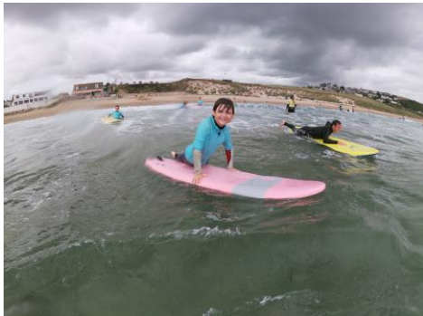
Penponds School Surf club