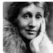
Virginia Woolf English Author